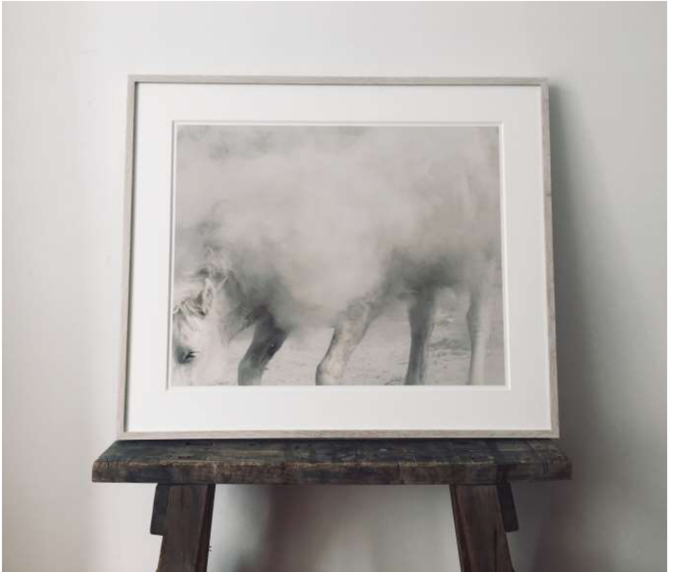
'chevaux sauvages 43°22'32N 4°48'37E #01' framed